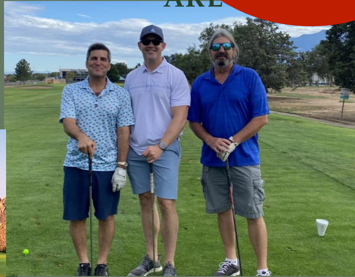
AHEPA Golf Tournament 2023

AHEPA 501 Chapter was founded in 1951. Its membership continues to work with numerous non profits and charitable organizations to help our local New Mexico community and beyond.